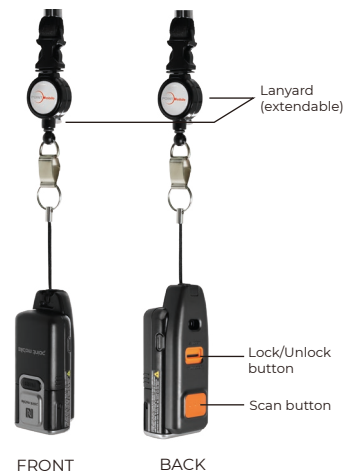
USB-C SLED (WITH LANYARD)

Corporate Headquarters Point Mobile Co., Ltd. pm_sales1@pointmobile.com +82 2 3397 7870