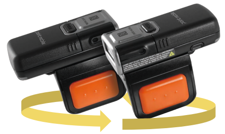
AMBIDEXTROUS RING TRIGGER

For the further inquiry, please contact: service@pointmobile.com