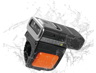
IP65 WATER/DUST RESISTANCE