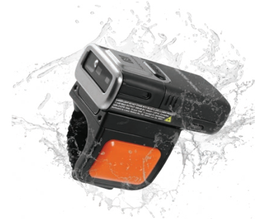
IP65 WATER/DUST RESISTANCE