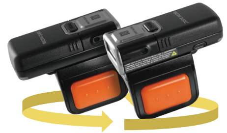
AMBIDEXTRIOUS RING TRIGGER

For the further inquiry, please contact: service@pointmobile.com